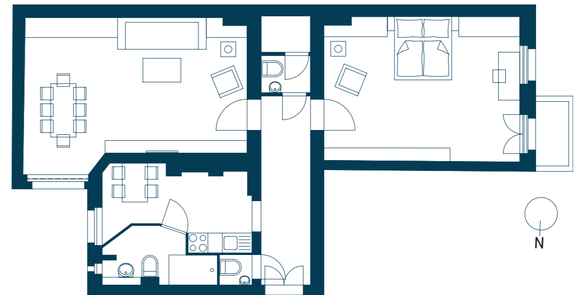
Floor plan example front house

FB = Front Building | GF = Ground Floor | UF = Upper Floor