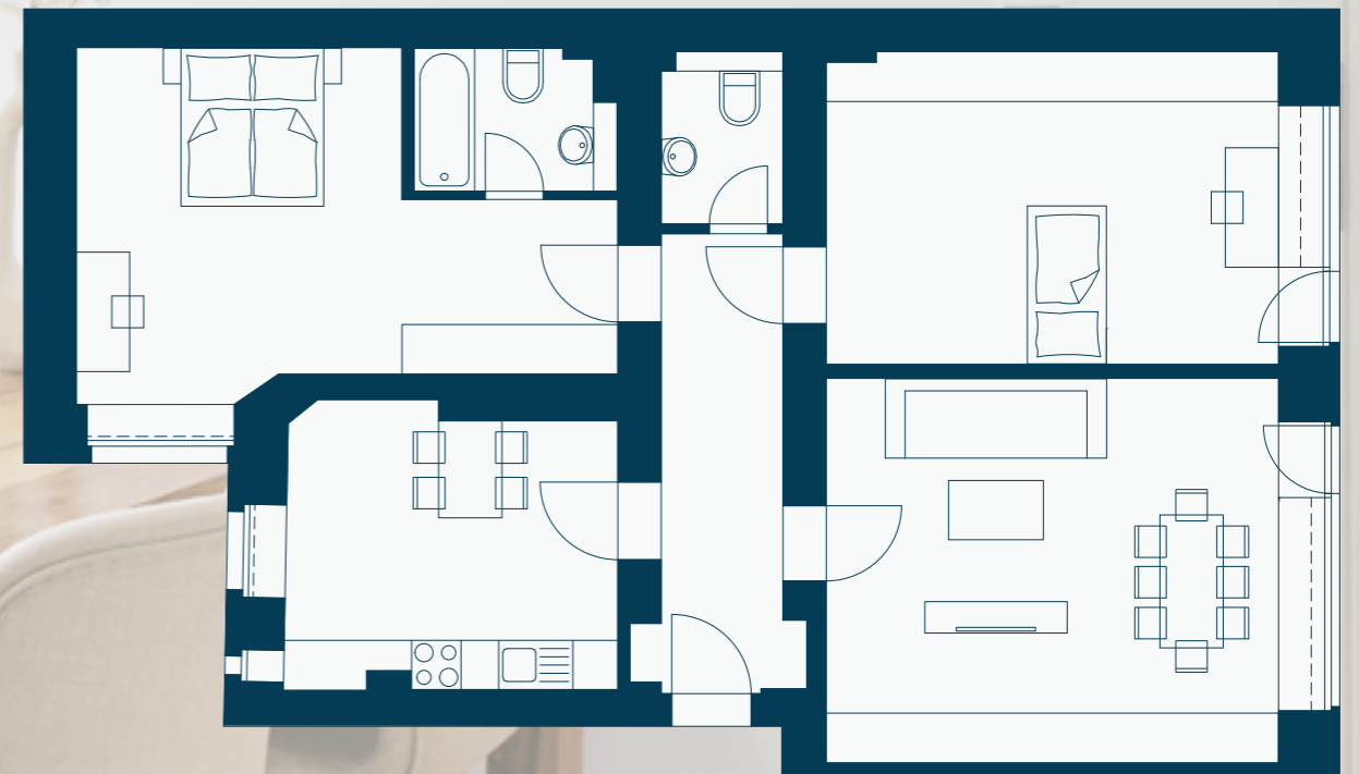
Floor plan example front house

FB = Front Building | GF = Ground Floor | UF = Upper Floor