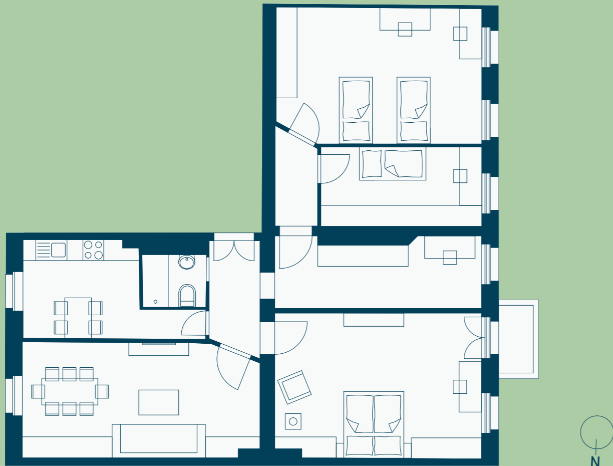
Floor plan example front house