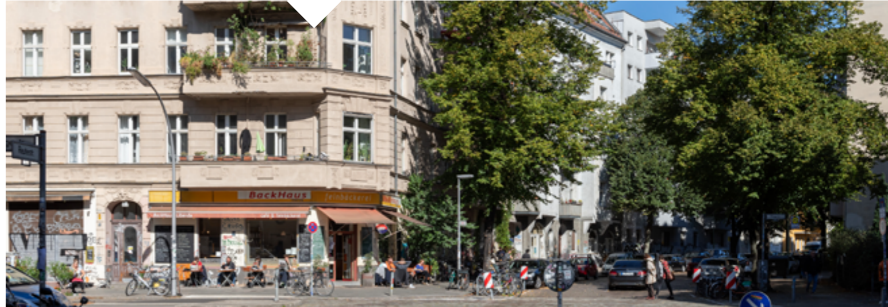
CITY HALL NEUKÖLLN